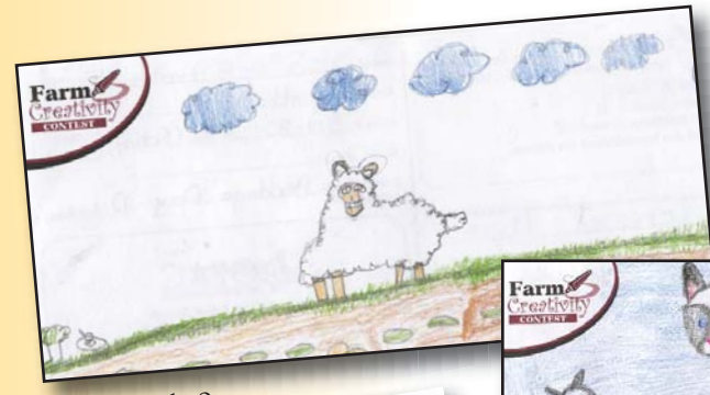
JK to Grade 2